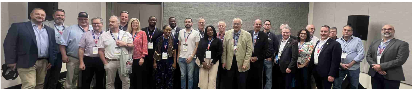
Connecticut turns out for the Area 1 Caucus