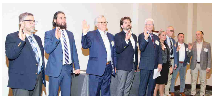
Board of Directors swearing in