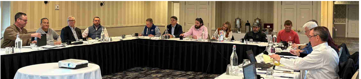
Strategic planning committee at work