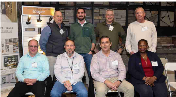
Building Officials from Groton City, Guilford, Enfield, Ledyard, Stonington, East Lyme, Franklin, and the State of CT