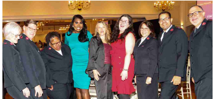
Foundation beneficiary – the Salvation Army

◆ The HBRA Charitable Foundation held its Biennial Benefit Auction on November 7th at the Aqua Turf Club with Shake Rattle & Roll Dueling Pianos. It was an evening of great company, lively bidding, and meaningful impact, raising more than $115,000. Every ticket, every bid, and every cheer helped fund scholarships and local programs that strengthen Connecticut communities.