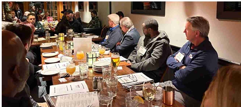
New Members and Board members at reception

◆ The HBRA Charitable Foundation held its Biennial Benefit Auction on November 7th at the Aqua Turf Club with Shake Rattle & Roll Dueling Pianos. It was an evening of great company, lively bidding, and meaningful impact, raising more than $115,000. Every ticket, every bid, and every cheer helped fund scholarships and local programs that strengthen Connecticut communities.