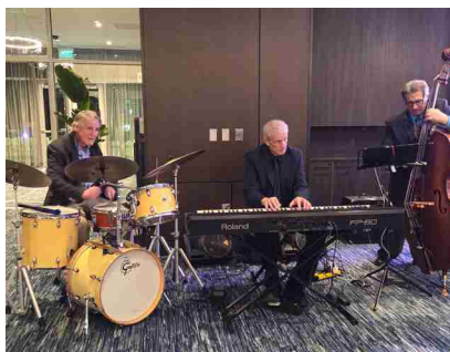
Beach House Trio