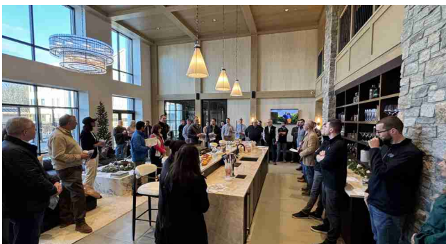
Multifamily Council members at The Olmsted in Farmington