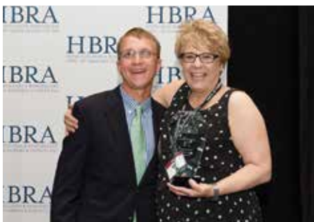
❖ President's Choice Award Fairfield County HBRA CEO

The red carpet event included both a Live & a Silent Auction to raise funds for the association's scholarship program, and the highlight of the evening was the presentation of Association Awards, which was followed by dancing to the music of Pimpinella.