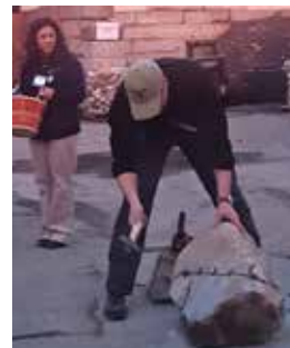
CT Stone demo